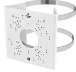
IK-AP27D Pole Mount