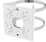
IK-AP27D Pole Mount