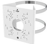
IK-AP27D Pole Mount