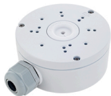
IK-AJ56A Junction Box