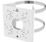
IK-AP27D Pole Mount