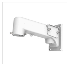
IK-AW06B Wall Mount